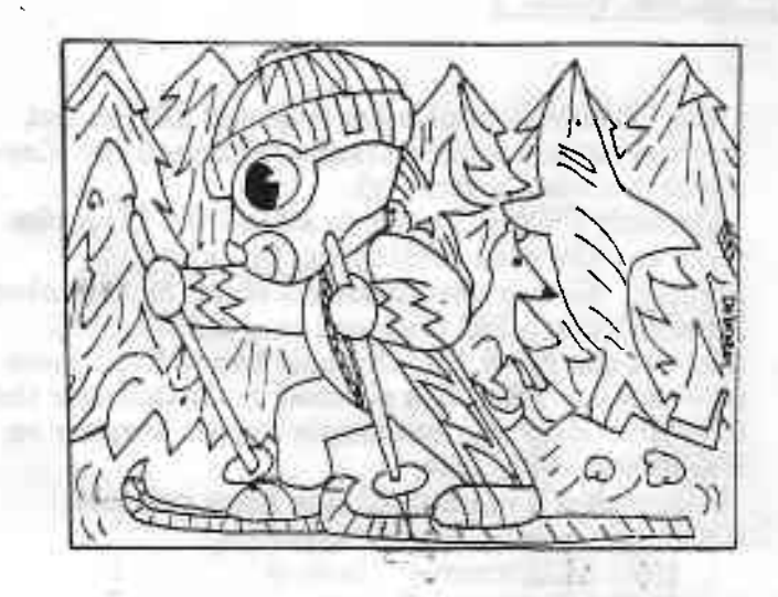
from The Mini Page by Betty Debnam © 1992 Universal Press 🧠 : (There are 13.)