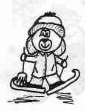
from The Mini Page

Join us for dinner on Tuesday, March 10, 1992. Meeting and greeting at 6:30, Dinner at 7:00 P.M. This month dinner is planned at BACCHUS-BETHESDA, 7945 Norfolk Ave., Bethesda. The BACCHUS is a moderately priced Middle Eastern (Lebanese) restaurant.