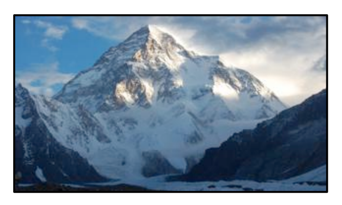
The Base at Ski Liberty is rapidly growing - they plan to open soon.

Brian According to Eardlev. snowboard business is in disarray. As today's considerably older snowboarders age, they do not convert to regular skis. They stop skiing altogether. And there just are not enough new potential boarders to fill the queue. Pity.