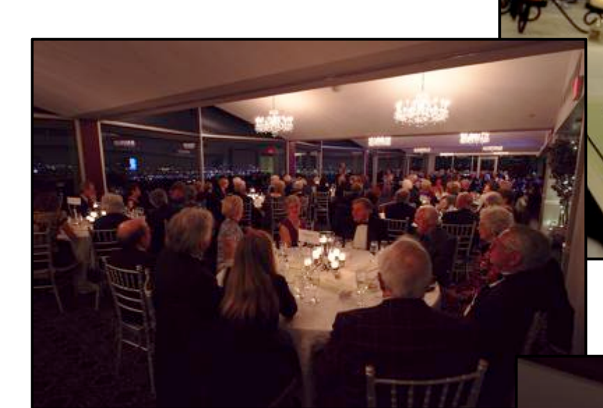
<< Ten elegant tables set for PVS members & guests overlooking Washington DC