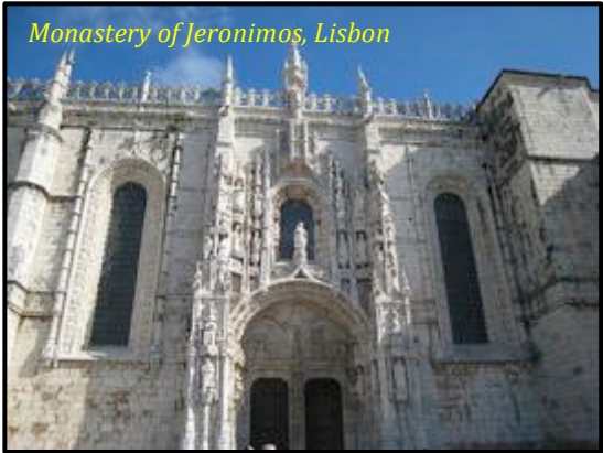
Monastery of Jeronimos, Lisbon