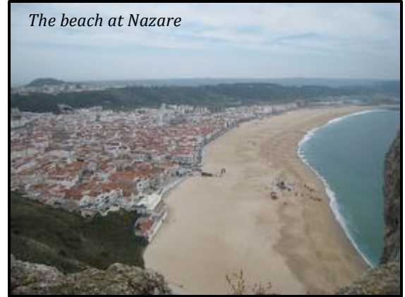
The beach at Nazare