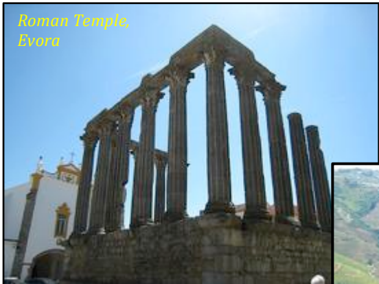
Roman Temple, Evora