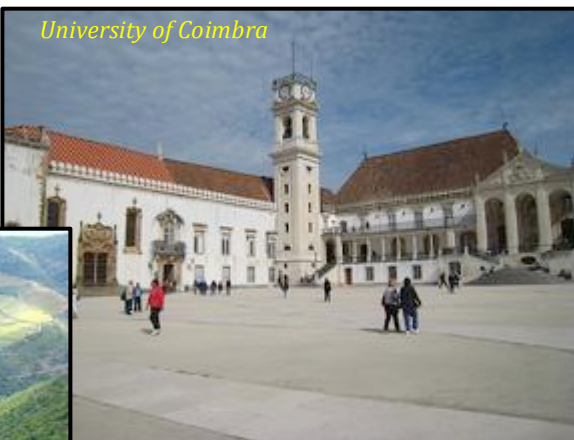
University of Coimbra