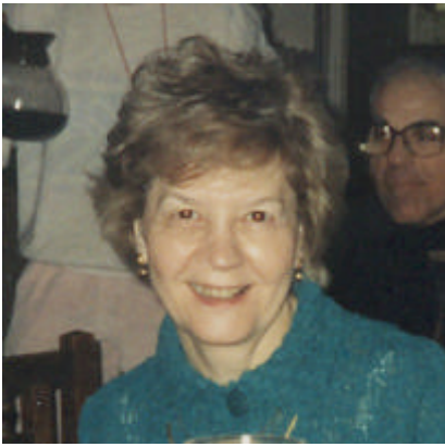
Mt. Sutton 1989