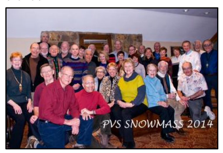
Our group at the Snowmass Club

breakfast, there was always hot and cold cereal, homemade breakfast cake, and either pancakes, French toast, or scrambled eggs. At lunch, we had a choice of two soups, such as minestrone, chicken gumbo, chicken with rice, cream of potato, ham and bean, and chili, along with excellent rolls and fruit.