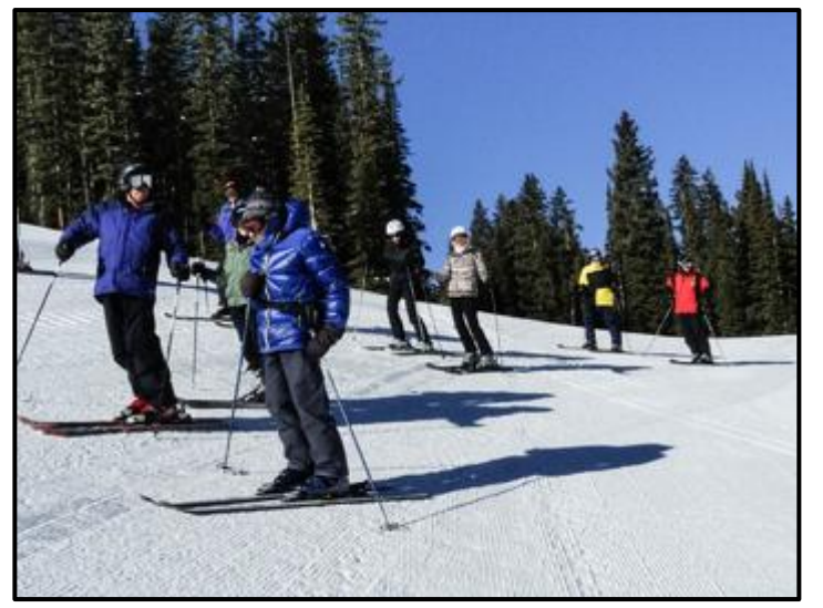
On the slopes and ready to come on down

sampled the fare of the many restaurants in Snowmass Village, and even a few in Aspen. Of particular note were II Poggio, an attractive Italian restaurant with excellent food; Venga Venga, a casual Mexican restaurant just a few steps up from the Mountain Chalet; and Ricard's, a new French restaurant near the Village Lift. Some PVS members liked Ricard's so much that they went back multiple times; with Rosemary and Dick Schwartzbard setting the record with four trips to Ricard's.