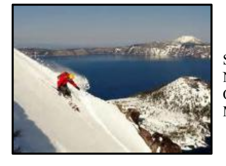
Skiing at Crater Lake National Park in Oregon on Cinco De Mayo.