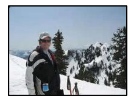
Skiing at Alpental in the Cascades in Washington State on Cinco De Mayo.

Skiing on Cinco De Mayo in the U.S? Yes, it is possible: