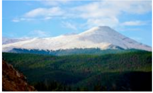
Breck's 10 Mile Range had a nice coating of the white stuff.

The best deal for local skiing is the senior midweek pass for $199.00 for those who are 65+. This has to be purchased by the end of October and will give you unlimited skiing Monday through Friday at Whitetail, Roundtop or Ski Liberty. You can go to the Fall Fest at Liberty Mountain on Oct. 16, enjoy the picnic lunch and purchase a pass. The regular mid-week fee at these resorts is $54. If you are 65+ you can ski for $27.00.