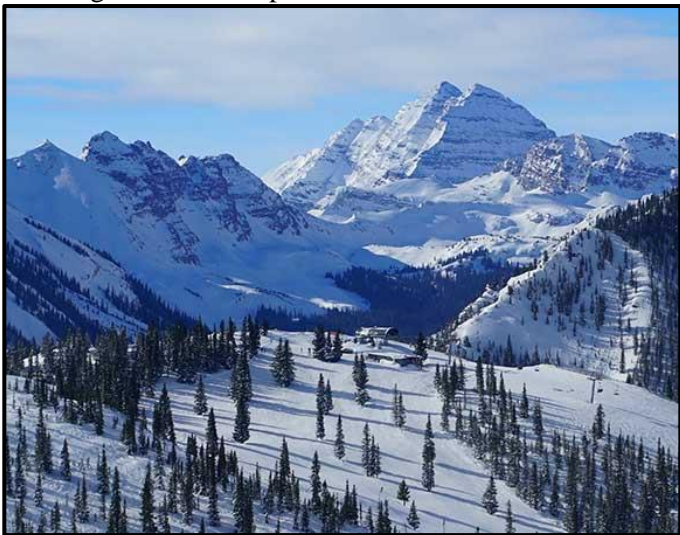
Blue skies & cheers!!!

The 2020 PVS ski season began on January 25 with the BRSC Aspen/Snowmass ski trip. It is a bit later in January this year than last year, but with a lot more skiers. Have a great, SAFE trip.