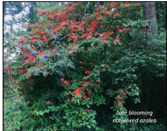
Late blooming native red azalea

The skiing situation is pretty much the same as we discussed in June. We are still seeking information