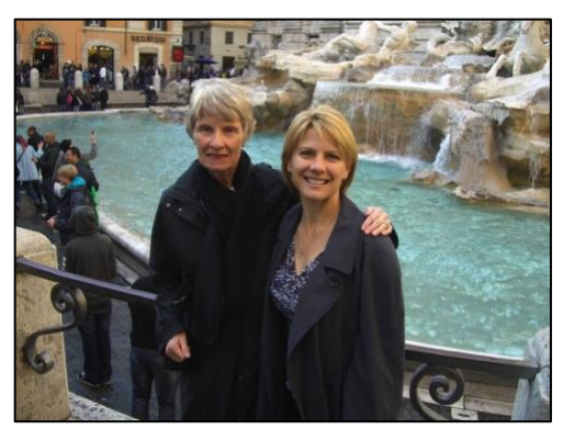
Rome - Trevi Fountain

Two years later, we broke our rule about nonstop destinations only, and headed north to Quebec where we stayed at the Chateau Frontenac (a strong desire of mine).