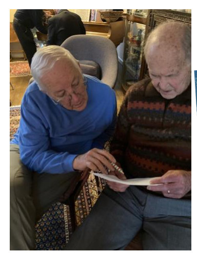
Solving the puzzle