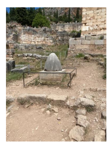
Delphi, Greece, known as the "Bellybutton of the Ancient World"

Next June we plan to go again on a Viking Sky cruise, "Mediterranean and Italian Sojourn, from Barcelona to Chioggia (near Venice). Dare we hope for temperatures that will be a bit less intense, and a calming of the State of the World aka viruses and all else?